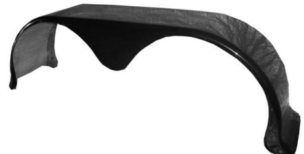
Fiberglass Full Tandem Fender