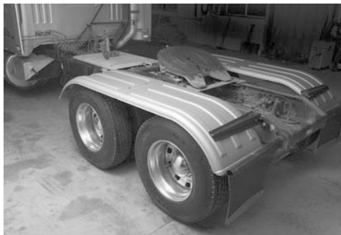
Minimizer Brand Poly Tandem Fenders